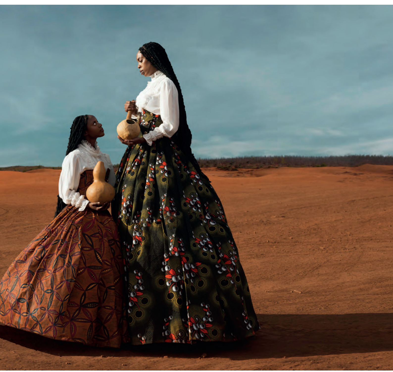
'Roots II' from the series African Victorian by Tamary Kudita