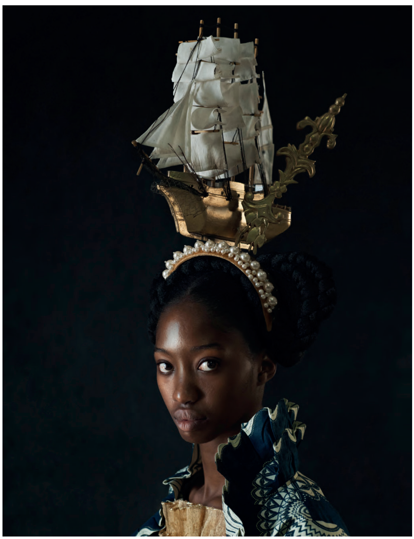
'Vessel', 2020, by Tamary Kudita