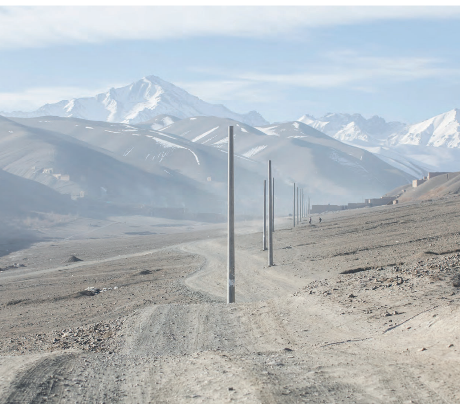
'Pylons 01' from the series Lost Connection by Rick Findler