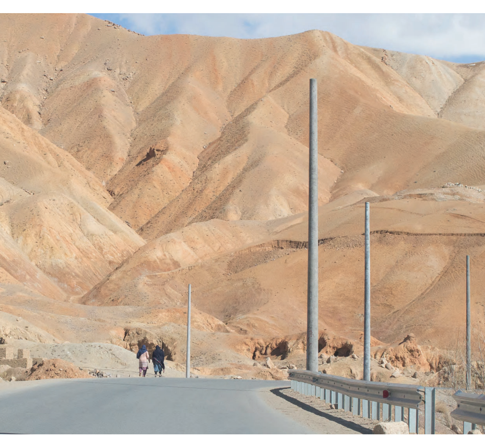
'Pylons 06' from the series Lost Connection by Rick Findler