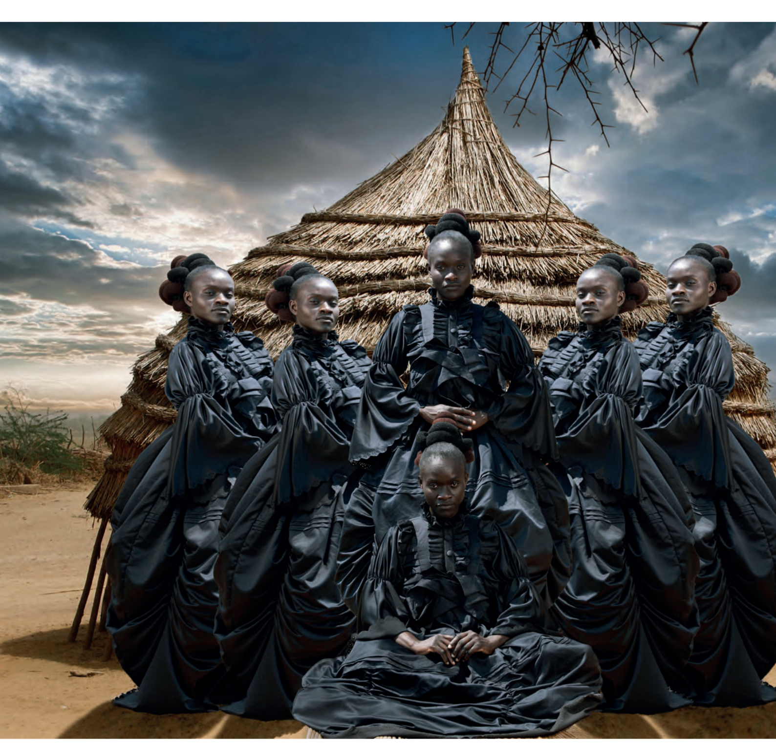
'The gathering' from the series {\it African\ Victorian\ by\ Tamary\ Kudita}